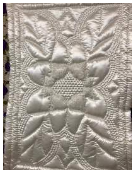
Photograph 15. Kabak Gülü pattern (Kılıç Karatay, 2019)