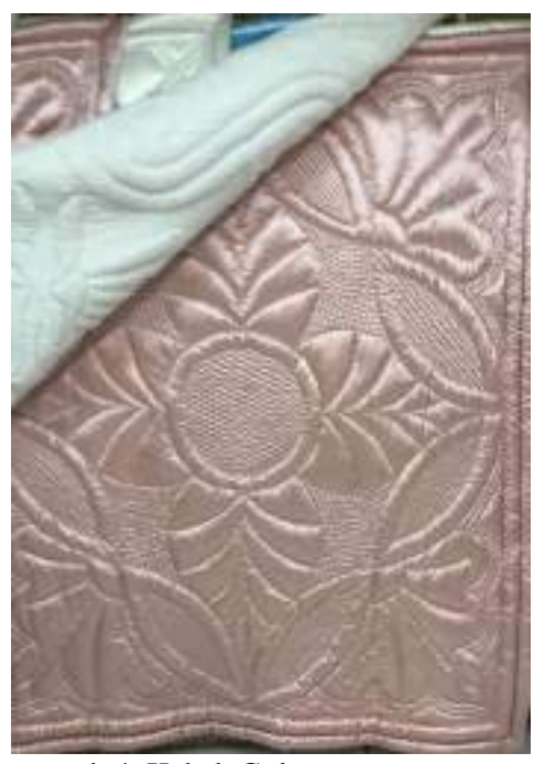
Photograph 4. Kabak Gülü pattern (Kılıç Karatay, 2019)