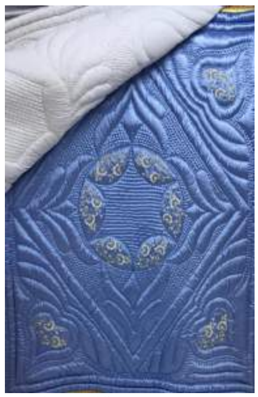
Photograph 12. Kalbli pattern (Kılıç Karatay, 2019)