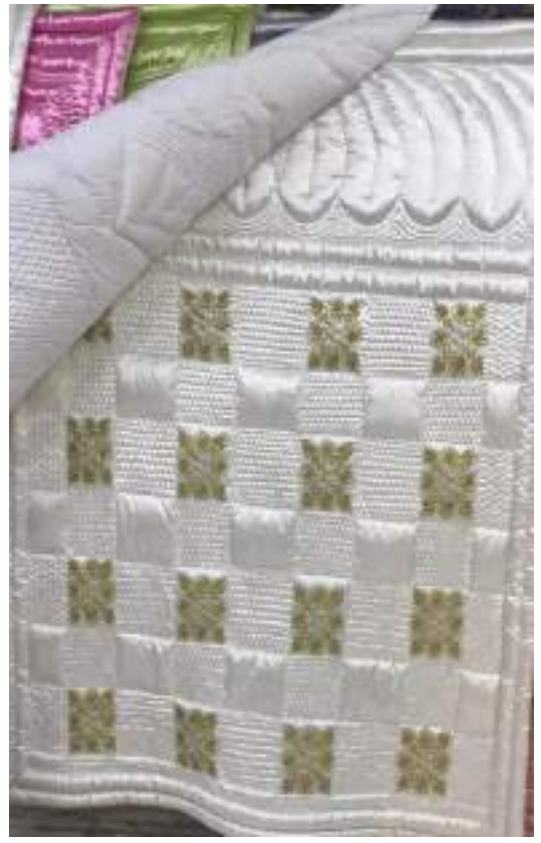
Photograph 17. Dilimli pattern (Kılıç Karatay, 2019)