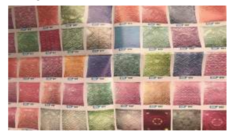
Photograph 2. Quilt Catalog Examples (Kılıç Karatay, 2019)

The masters dealing with Kilis quilt art use the catalog because the names of the local motifs used in the quilts are confused.