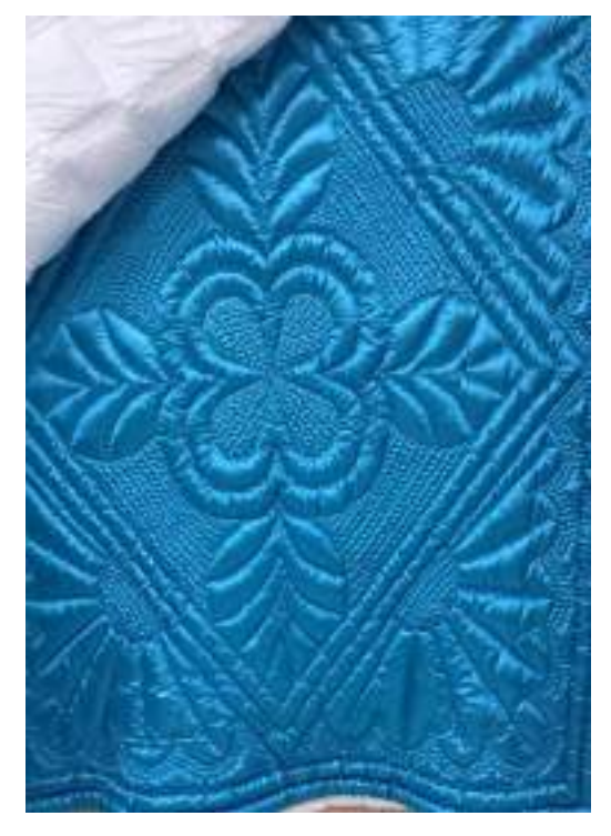
Photograph 7. Goncagülü pattern (Kılıç Karatay, 2019)