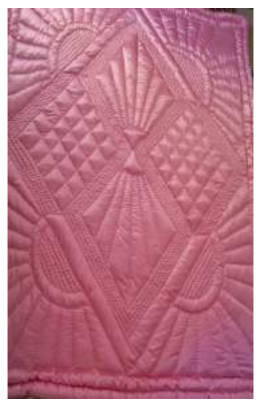
Photograph 19. Baklavalı pattern (Kılıç Karatay, 2019)