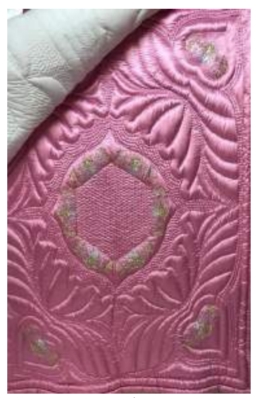
Photograph 11. Kanatlı pattern (Kılıç Karatay, 2019)