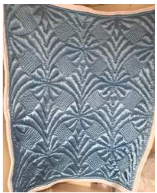
Photograph 3. Kurdela pattern (Kılıç Karatay, 2019)