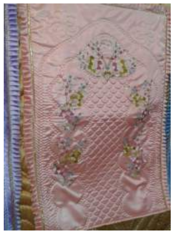
Photograph 9. Mihrablı pattern (Kılıç Karatay, 2019)