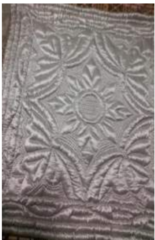
Photograph 22. Güneşli pattern (Kılıç Karatay, 2019)