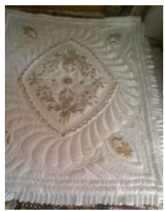
Photograph 6. Sırmalı Badem pattern (Kılıç Karatay, 2019)