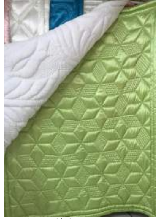
Photograph 10. Yıldızlı pattern (Kılıç Karatay, 2019)