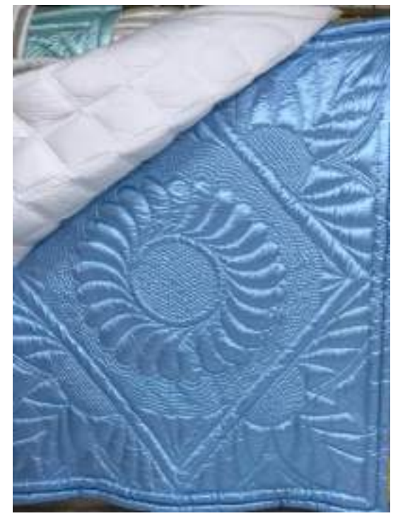
Photograph 8. Çarkıfelek pattern (Kılıç Karatay, 2019)