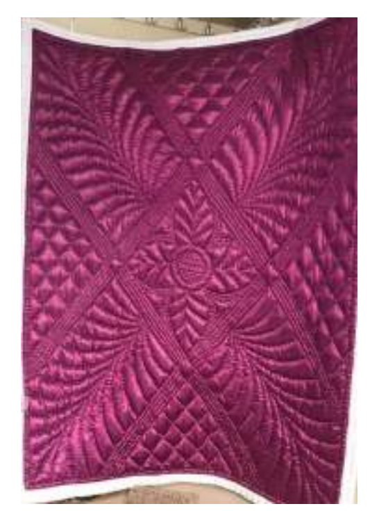
Photograph 13. Hurma Ağacı pattern (Kılıç Karatay, 2019)