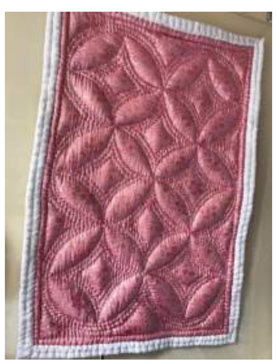
Photograph 21. Kelebekli pattern (Kılıç Karatay, 2019)