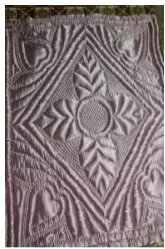
Photograph 20. Yapraklı pattern (Kılıç Karatay, 2019)