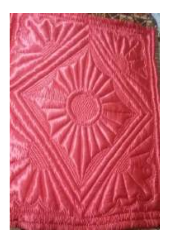
Photograph 14. Köşe Göbek pattern (Kılıç Karatay, 2019)