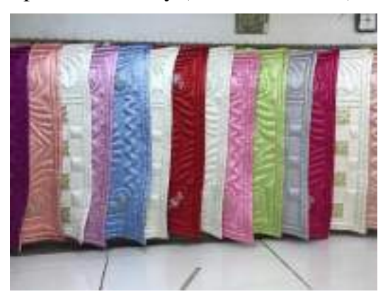
Photograph 1. Quilt model samples (Kılıç Karatay, 2019).

Models: It is the composition to be used on the quilt surface and models suitable for the customer's demand are processed today (Tahtkuran, 2019).