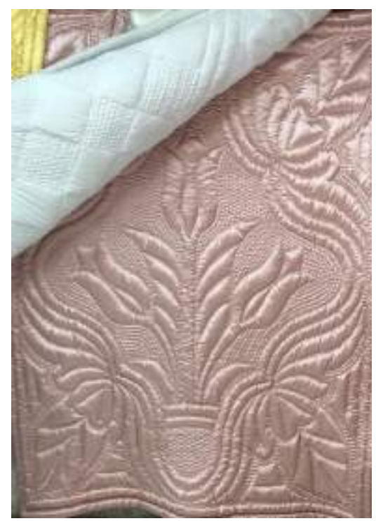
Photograph 24. Laleli pattern pattern (Kılıç Karatay, 2019)