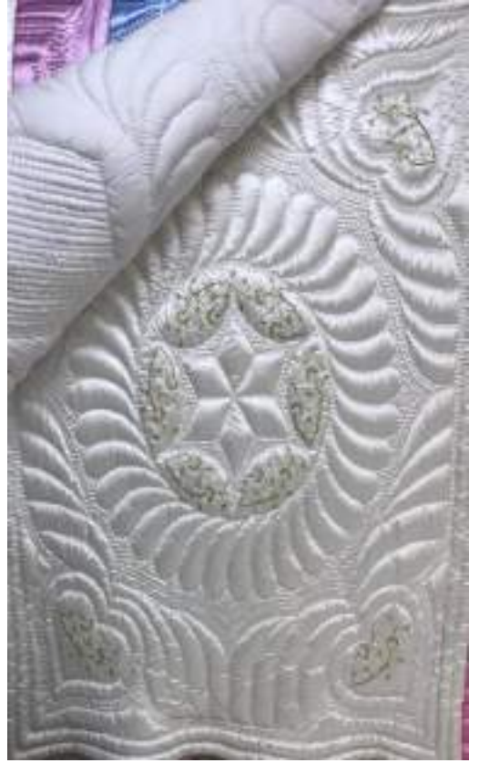
Photograph 18. Yıldızlı Çarkıfelek pattern (Kılıç Karatay, 2019)