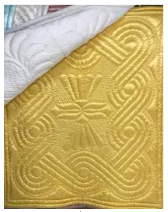
Photograph 23. Sarmalı pattern (Kılıç Karatay, 2019)