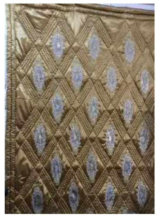
Photograph 16. Osmanlı Sırması pattern (Kılıç Karatay, 2019)